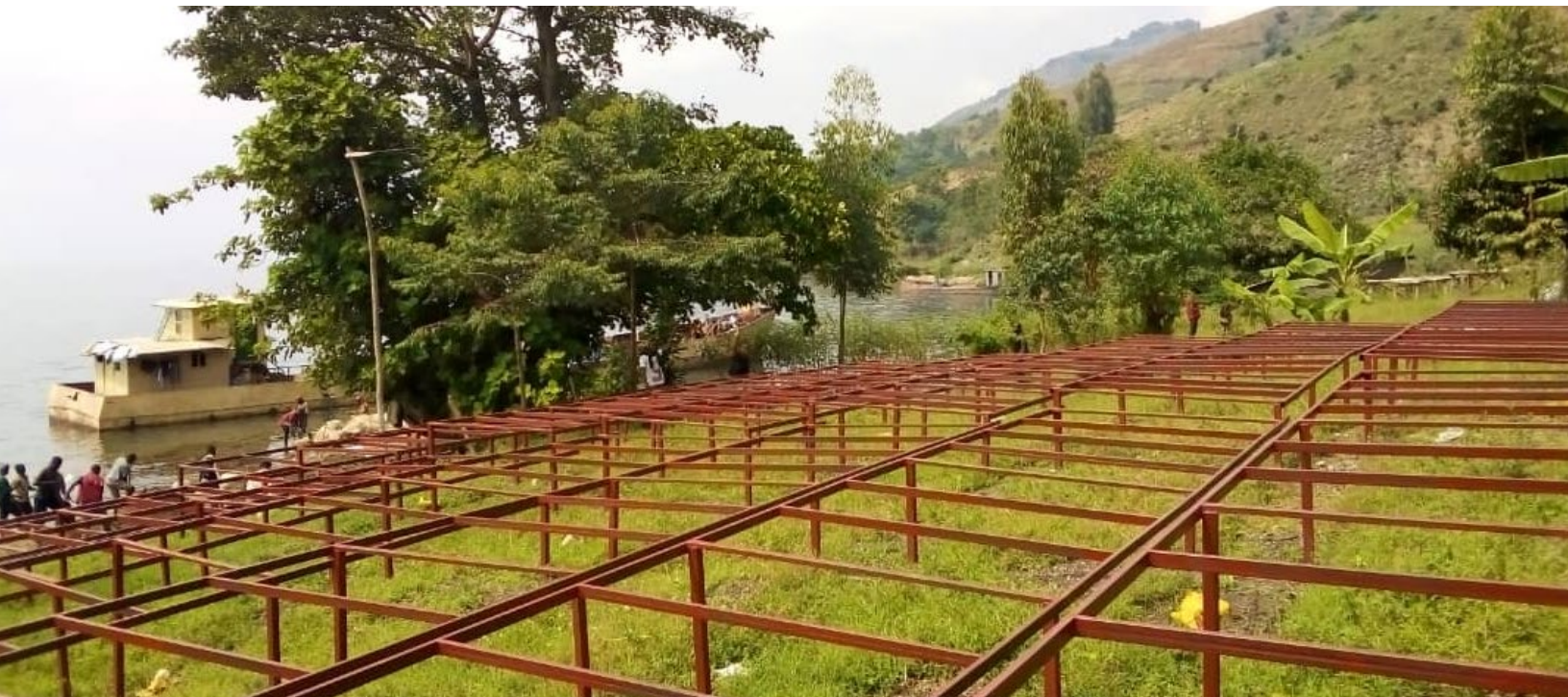
Reconstructed drying beds at Rebuild Women's Hope (RWH).