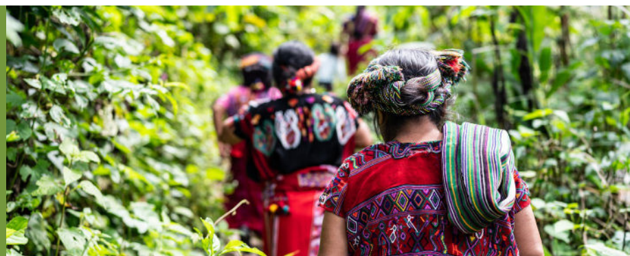
Women members of the Chajulense Association in Chajul, Guatemala.