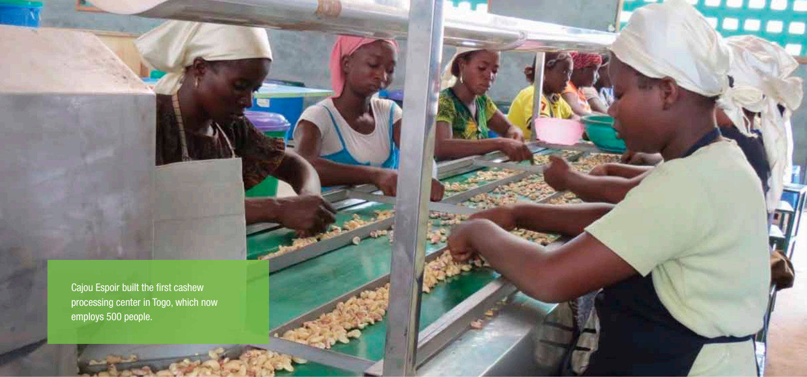
Cajou Espoir built the first cashew processing center in Togo, which now employs 500 people.